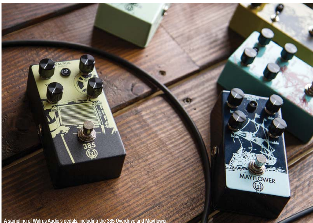
A sampling of Walrus Audio's pedals, including the 385 Overdrive and Mayflower.